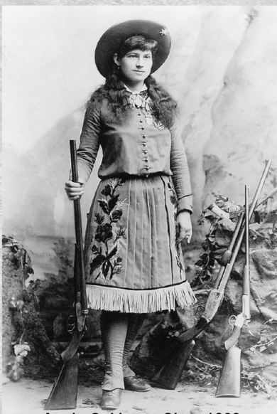
Annie Oakley @ Circa 1880s

WOMEN INSTRUCTORS, COACHES, AND SAFETY OFFICERS