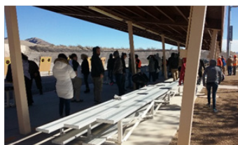
The calm before the crowd

The Nevada Firearms Coalition along with 5 other locations throughout the Las Vegas valley participated in this citywide event: (The Gun Garage, Bass Pro Shops, The Range 702, Green Valley Range, and Discount Firearms) along with the volunteer hosts (ADAPT Academy, Silver State Shooting Academy and more...)