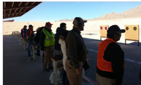
Safety on the line

Consisting of 1.5 hours of classroom instruction followed by 1.5 hours of range instruction the attendees received the fundamentals of firearms safety, vocabulary, and marksmanship. All weapons and ammunition were provided free of charge to the participants from various local donors (New Frontier Armory, Silver State, etc...) and corporate sponsors (Smith and Wesson, Beretta, Sig, and Browning to name a few)