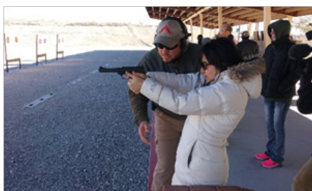
One on one instruction

All opened their doors, donated their time as well as volunteer Instructors and Range Safety Officers