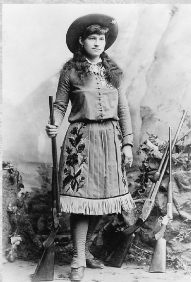
Annie Oakley @ Circa 1880s

WOMEN INSTRUCTORS, COACHES, AND SAFETY OFFICERS